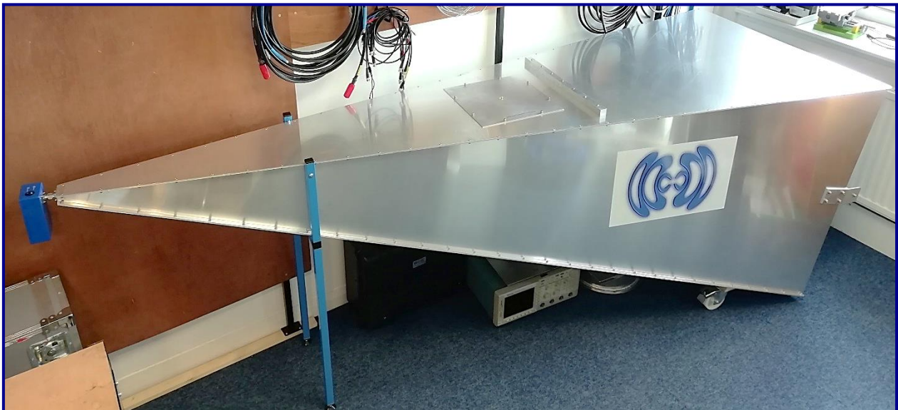
GTEM transient test cell (nominal size 3.2 m long, 1. 1 m wide, 1.2 m high)

High Frequency Diagnostics offers design and consultancy services to clients wishing to establish their own calibration facilities that will streamline the development of UHF sensors for partial discharge (PD) detection in high voltage plant including GIS, transformers and switchgear. The calibration system is also valuable for quality control and certification of performance during production since the calibration of each PD sensor takes only a few minutes. Based on the award-winning system developed by the founder of High Frequency Diagnostics, Dr Martin Judd, in 1996, the system uses a GTEM cell to measure effective height of the sensor. This procedure has been used for nearly 30 years to verify and calibrate the sensitivity of thousands of UHF PD sensors.